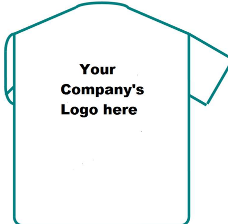
Sponsor's Name/Logo - Phone Number (if desired)- only (Max – 2 Colours*) (*Third or more colours are subject to further costs)