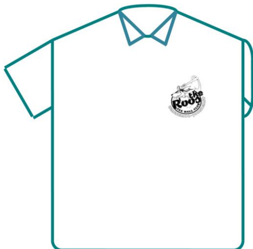
Polo style shirt with WJTBC Logo (Embroidered in colour)